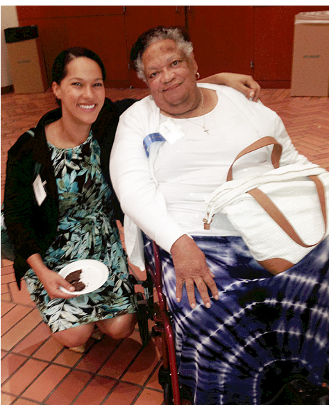
Photos from the annual CART symposium: Advances in Autism 2015. The conference was held at UCLA's Neuroscience Research Center on May 22, 2015.