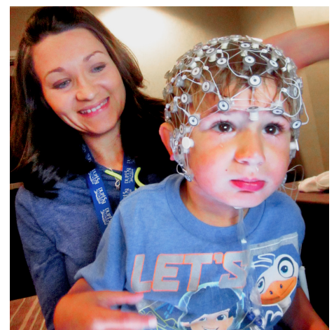
Photos from the Dup15q Alliance Family Conference in Orlando, Florida.